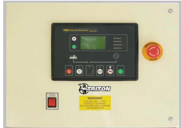
The panel is constructed in 1.5mm steel, powder coated to RAL9001 for a high quality, durable finish.